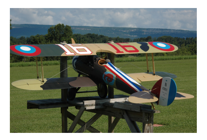
Ready to take to the air after three years in the making.