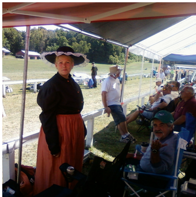
The Old Rhinebeck Aerodrome show traditionally include a “through the years” fashion show with volunteers from the audience modeling the garments.