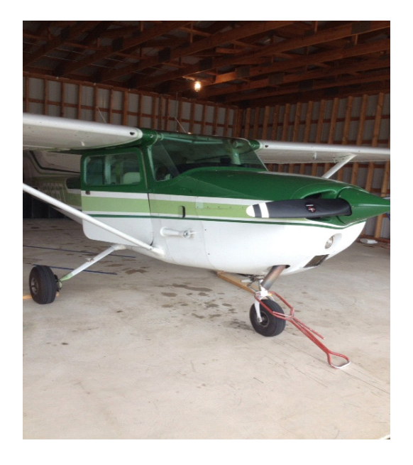
The plane that Jonathan took me for a flight in.