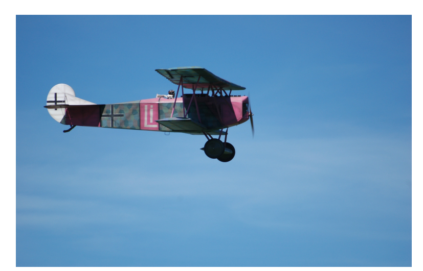
And the D 7 in the air.....