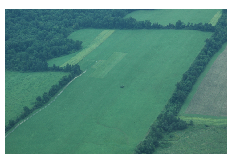
Naturally we had to take a look at the MHRCS Wallkill field from the air!