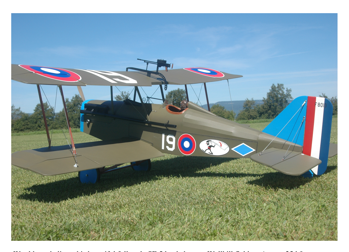
Would you believe this beautiful full scale SE 5 landed at our Wallkill field on August 25th?