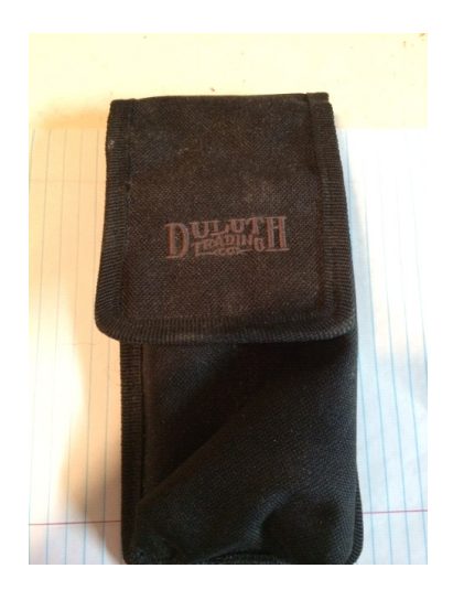
The tools come in this small case from the Deluth trading Company for $39.50.