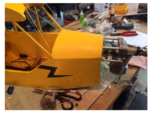
The Cub almost ready for clear coat.