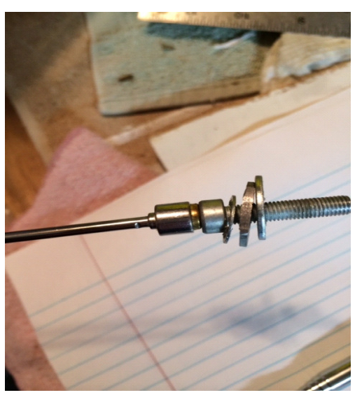
The bolt and washers on the magnet. On final installation, only a washer will be installed on the inside.

The hole in the dashboard will be covered up by the 1/4 scale instrument panel that my buddy Neil Hunt gave me for the plane.