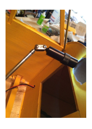
This small flashlight was perfect for the job.