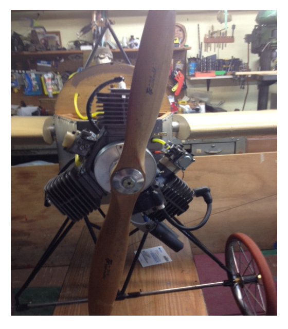
The mystery engine....Anybody know what it is? It will be at Rhinebeck 2012