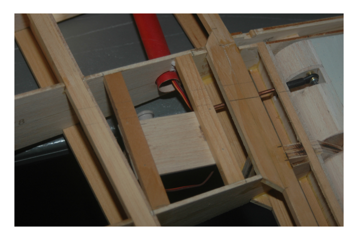
An inside view of Roy's next project.