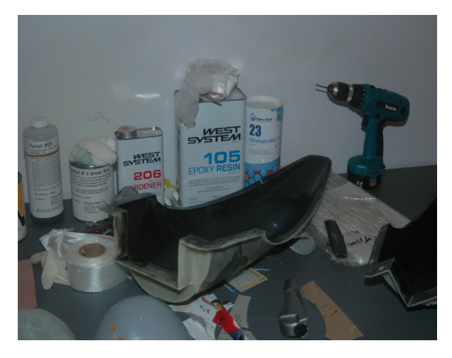
If you didn't write down the names of some of the supplies needed for the molding, this may help.