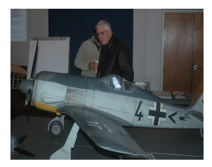
One last admiring look at one magnificent model aircraft.