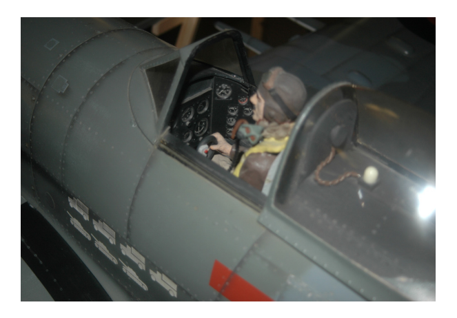
Man does that look good!