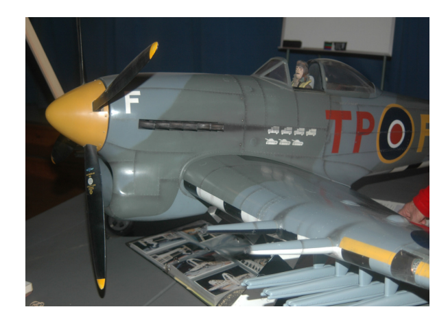
The Top Gun!