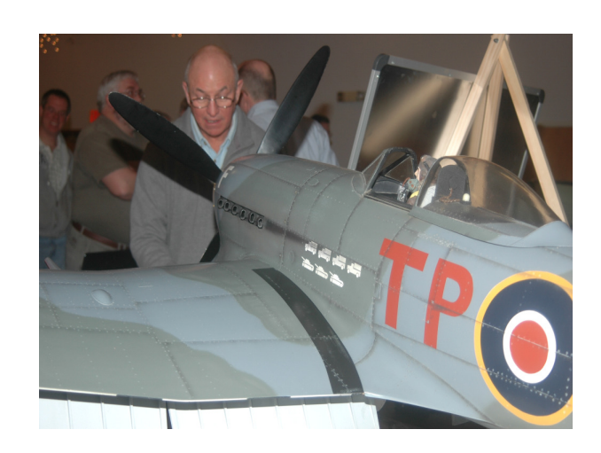
Looks like a blessing of throats!