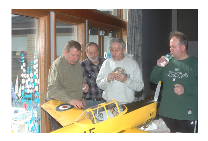
A great looking plane, Bob