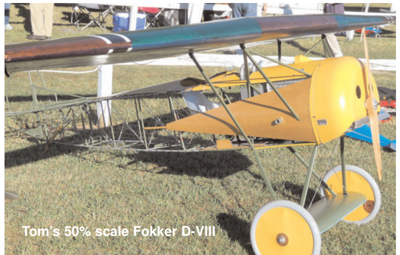
Tom's 50% scale Fokker D-VIII