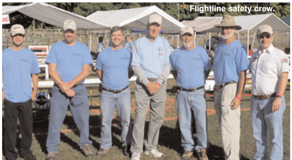
Flightline safety crew.