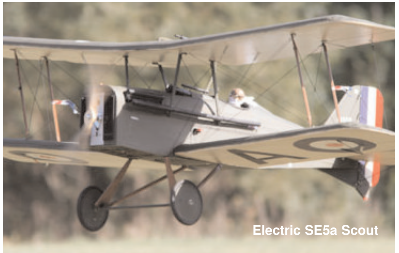
Electric SE5a Scout

A2Z Corp ~ Dremel Robert Bosch Corp MicroFasteners Precision Cut Kits Sig Mfg. ~ Troy Built Models Vailly Aviation West Mountain Radio RCL Fasteners